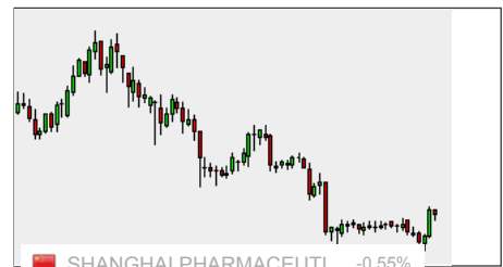
CVC others explore sale of drugmaker Abogen