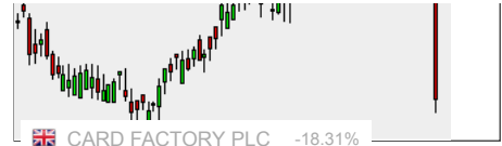
Profit hit by weak pound and rising costs