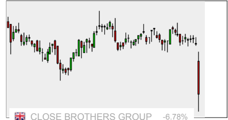
British lender Close Brothers warns of competition; shares fall