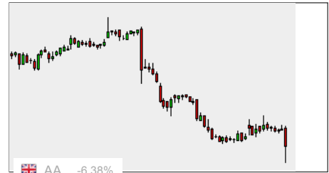
Motoring group AA appoints CEO as it lowers profit forecast