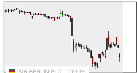
Eyeing Air Berlin, Lufthansa board backs extra investment for Eurowings