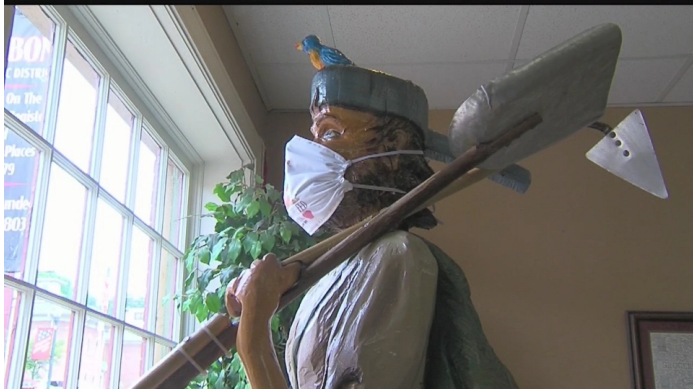
Lisbon sells apple-themed masks to community in light of canceled festival