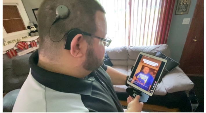
Youngstown man shares pandemic struggles as a deaf person through videos on social media