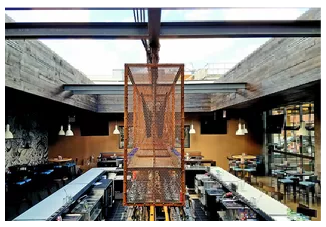
Federales is a Four Corners bar.

Four Corners , the owners of several Chicago bars — including Benchmark, Brickhouse Tavern, and WestEnd — have been hit with a class-action lawsuit by workers with an attorney alleging the company has withheld more than $30 million in tips from servers and bartenders from 2011 to 2018. The lawsuit names 17 Four Corners' establishments and could affect as many as 800 employees.